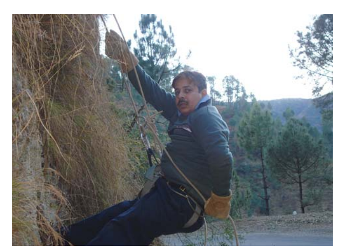
IRFC Adventure - Trek to Rajgarh (H.P.)