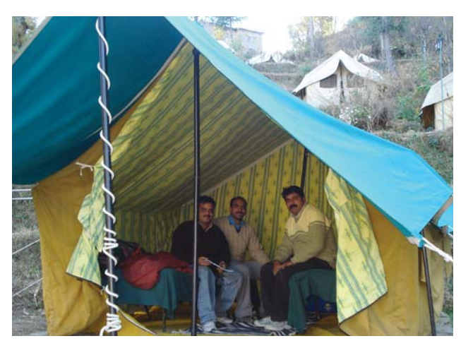
IRFC Adventure - Trek to Rajgarh (H.P.)