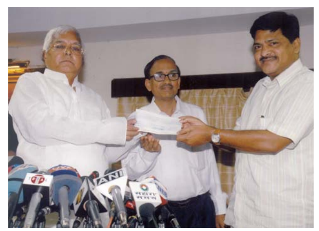
IRFC handing over cheque for Rs. 2 crore to Hon'ble Minister of Railways towards contribution to Railway Minister Welfare and Relief Fund.